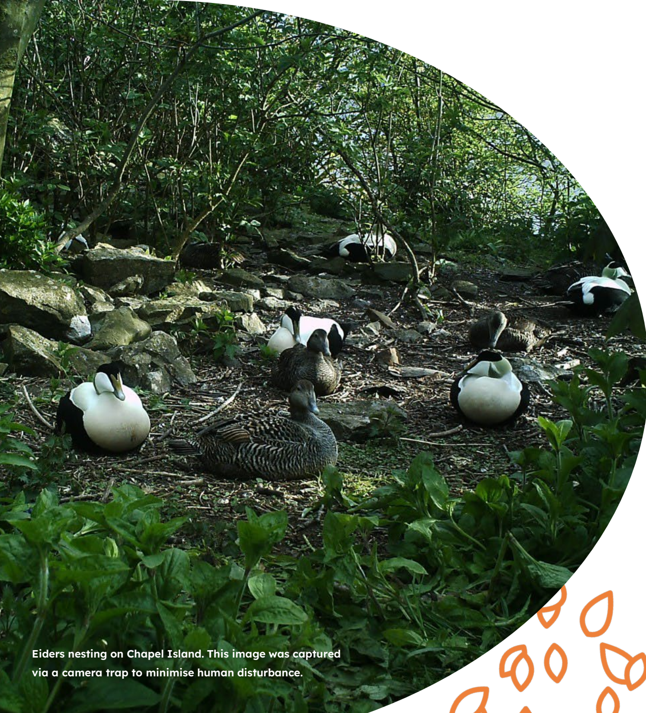
Eiders nesting on Chapel Island. This image was captured via a camera trap to minimise human disturbance.